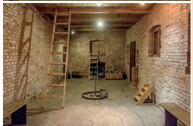
The Room of the Tree, renovated by STUDIO||ROSA before, during and after ATIS 2015 seminars. Installation by Grzegorz Ziółkowski, 1 October 2015