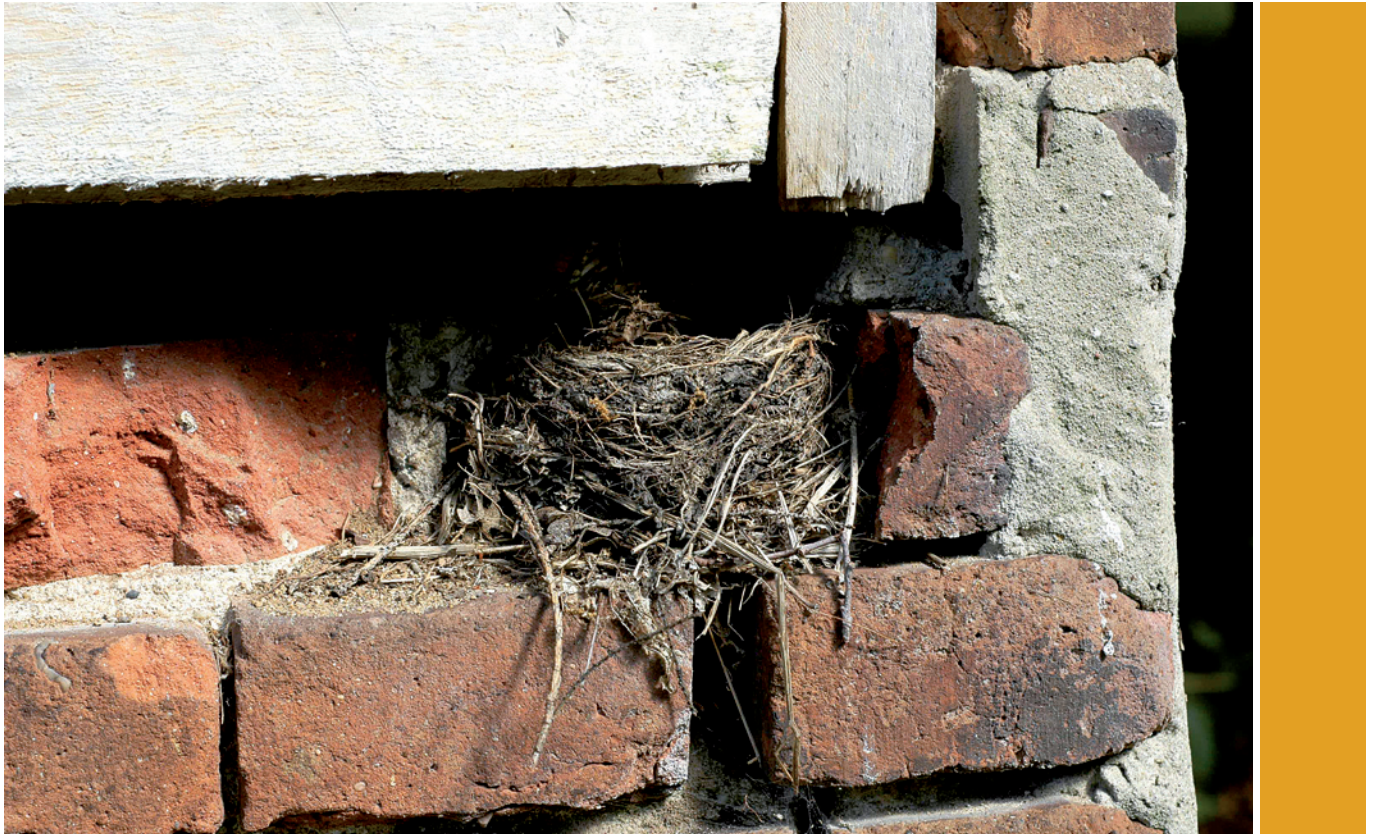
Brzezinka 2008

THE ATIS SPARK team took part in SHARING on 30 September 2015 – an open encounter with guests when elements of individual, partner and group work of ATIS NICHE were shared, or presented (in the sense of giving someone a present, a gift of your full presence).