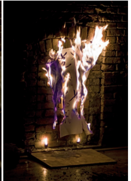
Sim Fong Zoe Lai (China)